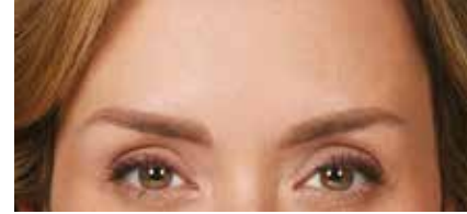
After (Day 30)