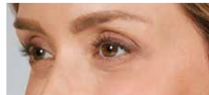
After (Day 30)